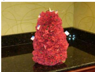
Unit entry in Poppy Contest at Mid-Winter

Founded in 1919, the American Legion Auxiliary is the world's largest patriotic women's service organization. With a membership of nearly 900,000, local ALA units have a strong presence in more than 9,500 communities nationwide. The ALA's mission TO SERVE VETERANS, THEIR FAMILIES AND THEIR COMMUNITIES is carried out through its hundreds of outreach programs delivered by its members, volunteers and national headquarters.